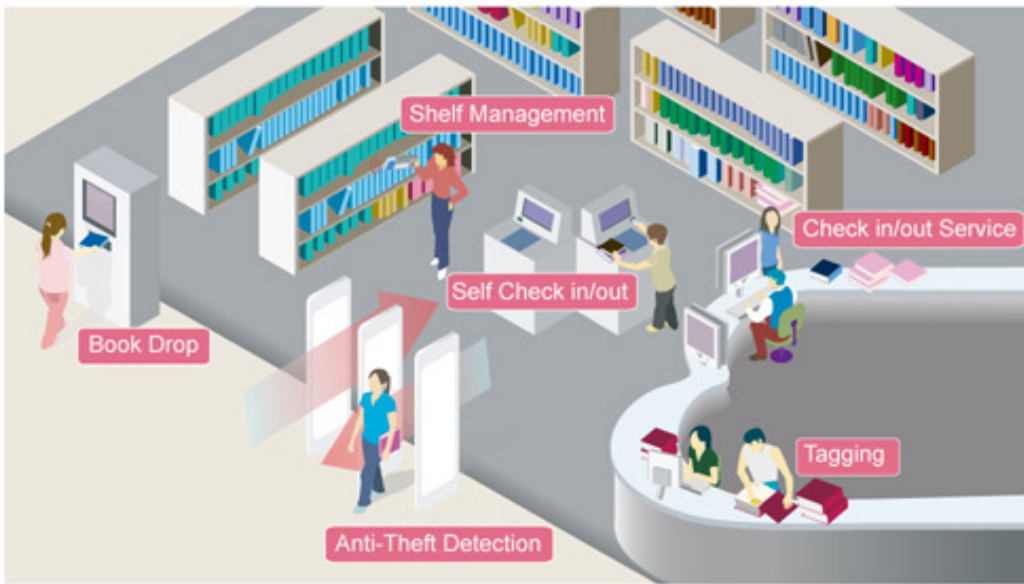
Process in RFID based library management system